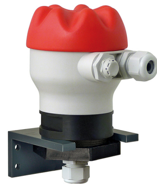
BJSC PVC angle bracket