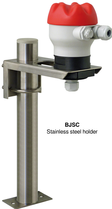
BJSC Stainless steel holder

The stainless steel holder is designed for an horizontal surface and the PVC angle bracket for wall mounting.