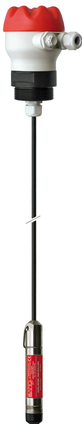
Example: Application with a NIVAPRESS