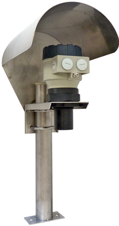
Support with protective cover (Optional)