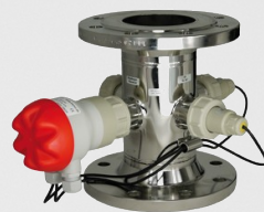
TRUBOMAT GAB 0-20 FNU / 0-1000 FAU 4-20 mA output