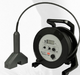
MUDLINE Portable measurement for sedimentation basins