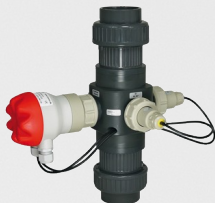
TURBICUBE 0-20 FNU / 0-1000 FAU 4-20 mA output