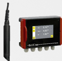
TURBINUM 442 + BAMOWIZ TUR 442 5 to 4000 NTU/FNU 0 to 4500 mg/l