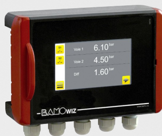
Option DIGITAL DISPLAY BAMOWIZ Contacts + 4-20mA + Modbus

...FNU/ FAU Indicative values may vary according to product concentration and composition