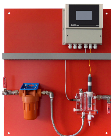
Complete measuring system (assembly sold separately)