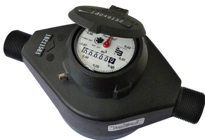
(LCD totalizer or 6 rolls counter on dial)