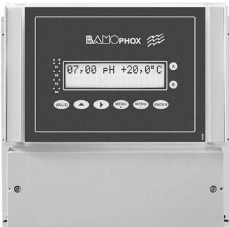
Wall mounting BAMOPHOX 106