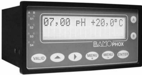
Panel mounting BAMOPHOX 106