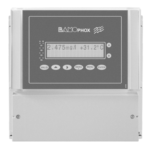
Wall mountig (main device)