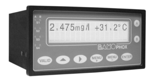
Panel mounting (main device)