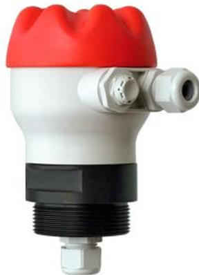
BJS junction box (recommended option)