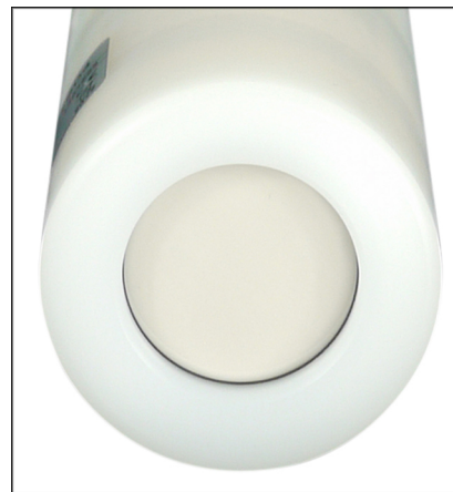
Bottom view of the sensor